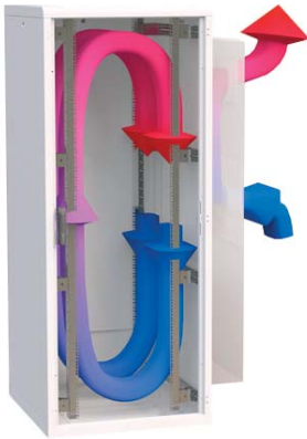
AIR FLOW THROUGH THE RACK – COOLSPOT DX WM VERSION