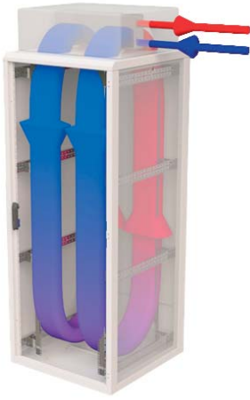
AIR FLOW THROUGH THE RACK - COOLSPOT CW TM VERSION