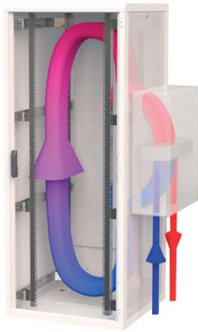
AIR FLOW THROUGH THE RACK - COOLSPOT CW WM VERSION